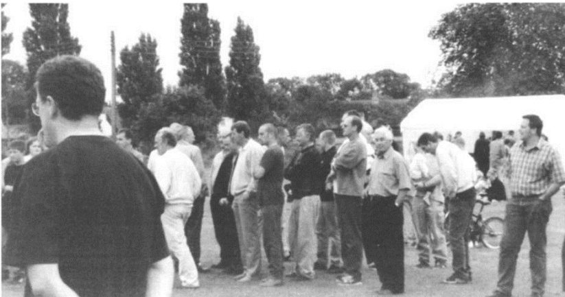
Team Spirit - Competitors lining up to participate in the wellie throwing competition